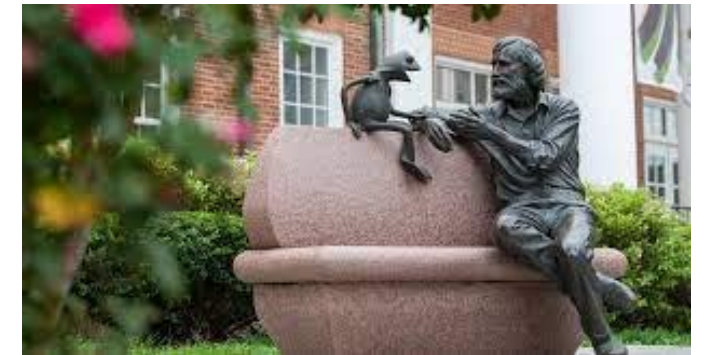
UMD Campus Tour

Pictures? Please send to 2023@qcrypt.net